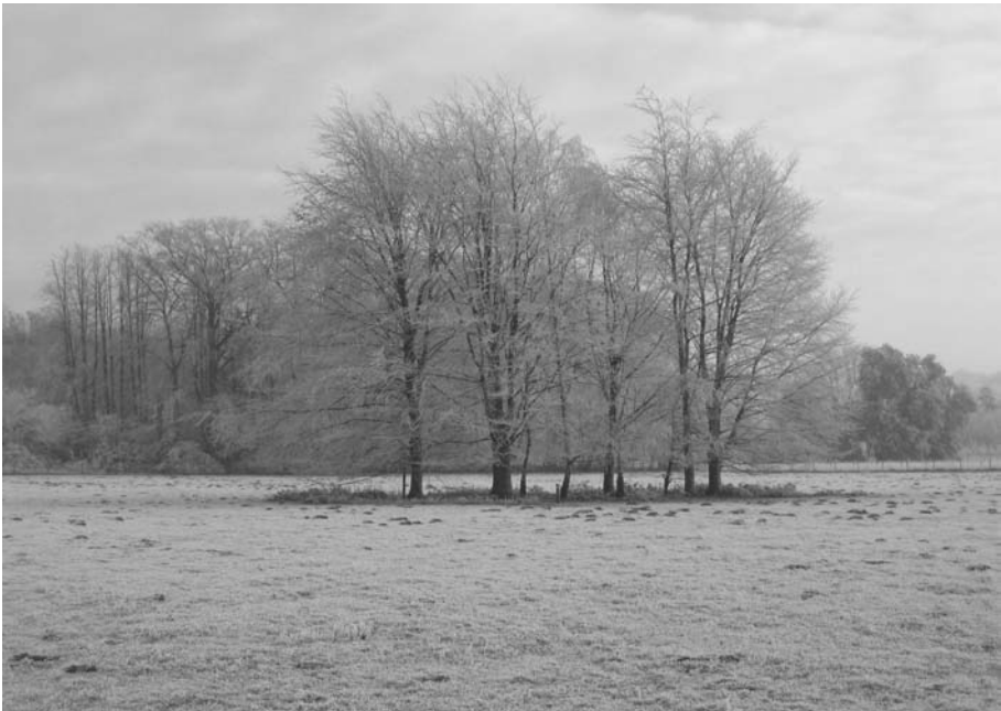
Hoar frost at Wandlebury Cambridge Preservation Society

A Bit More Shelford History – Things Found